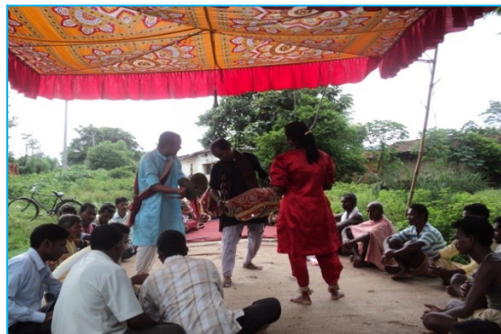
The Pala Group is going in with the Cultural Program on Environment Protection at Puri Sadar Block of Puri district.

The Organization has been associated deeply having close affinity and rapport with various communities on the aspect during implementation of several Welfare and developmental activities. The organization seeks the active cooperation and involvement of the concerned communities during the project activities. As a social obligation and being the part and parcel of different communities the Society is witnessing on several Festive occasions and cultural programs organized by the community concerned. Therefore, on the initiatives of the organization the Dramas, folk dances, song competitions, etc. are organized in each year where the large numbers of people including men and women meet together for exchange of ideas, views and entertainment. Our Society avails this opportunity to address the problems, such as drug addiction, deforestation, superstition, illiteracy, abuse of environment etc. in the form of entertainment i.e. drama, folk, dance etc. Involving the local youths for receiving wider public response. In this connection, the Organization facilitates Local Folk dances, Dramas, Sankirtans, and other Melas, for the purpose togetherness and unity among diversified groups. During this year of report the society has organized Folk dances, Dramas in the district of Puri for the purpose of heritage preservation and cultural high lights with special focus.