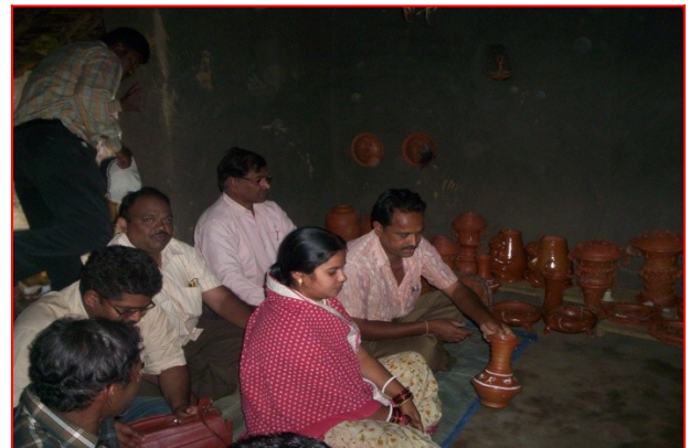
A view of skill Development Program on Terracotta training held at Gop Block in Puri district.

The Society is seriously concerned about large scale un-employment in Rural Sectors especially. While the modern Society has changed its traditional outlook and diverted its attention towards technical and developed process of living followed with well equipped thoughts and activities thereon. Therefore, in this context trained and skilled capacities of the youths are to be increased following the rapid development and growth of the Society. There is no such proper facility and scopes either in concerned localities or any effort is being delivered to the deserving youths found with wandering in the streets by the Govt. and Non-Govt. agencies to provide required employments for such un-employed idle youths. In this backdrop , it was decided to launch programs like trainings, orientations and Vocational Educations encouraging them for self-employment. Thus, during this year a total of 5 nos of workshops were held at Nimapada, Gop, Kakatpur, Astaranga and Puri Sadar Blocks in Puri district to provide opportunity for different Skill development