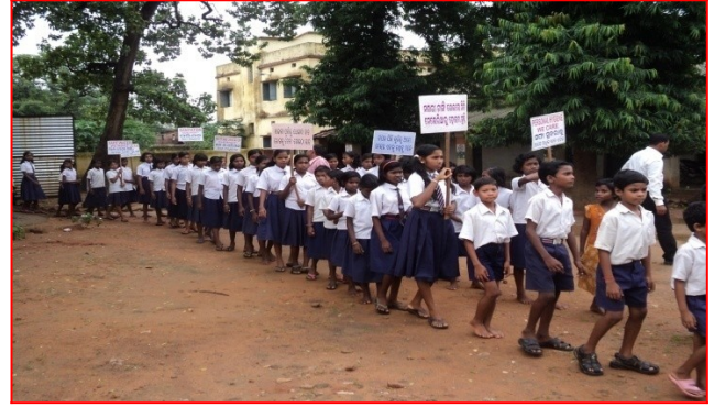
The Water & Sanitation Campaign by the School Children of Kakatpur Block in a Rally organized by S.P.Foundation during the year 2013-14