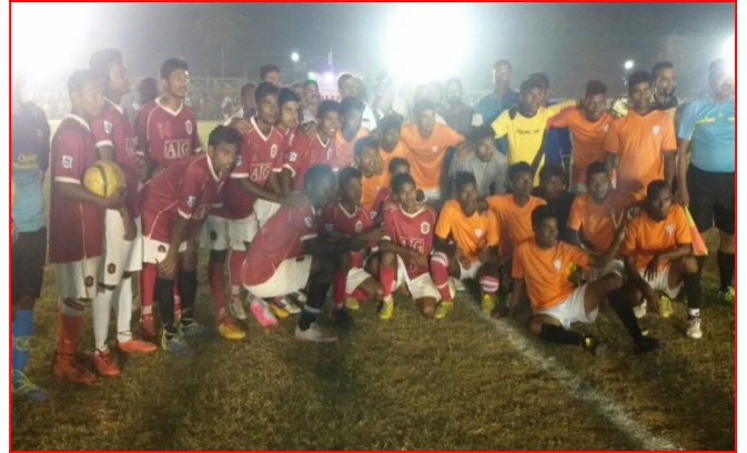
The Participants of Foot Ball Tournaments held at Nimapara during the Year 2013-14

Students of the Project area promoting towards establishing a future Sports careers, both State and National level. This activities not only creates an eco-friendly atmosphere but it intertwines with many hearts together with a fellow feeling to achieve a common goal . During the reporting year of 2013-14 , we have Organized Cricket Tournaments , Volley Ball Tournaments, Bad Minton Competitions, Chess & Carom along with Kabadi Games at the Block Head Quarter Nimapada of Puri district to involve the School & College Students , Athletes from different spheres of the district for promotion and creation of a Sports spirit among the inclined youths. The Games & Tournaments are particularly organized i.e Cricket , Volley Ball & Kabadi during January, Chess & Carom in February and Foot Ball from September to November as a regular schedule plan of activities. The Organization seeks participation and encouragements by inviting the PRI Members, Local Govt. Officers, Like Tahasildar, Block Development officers, including representatives from health Department for successful achievement of the objectives of such sports activity. In this connection, the Society distributes Awards, Prizes and incentives to the winning Teams and individuals for their encouragements towards sports and games. It has been decided to give special focus for more sports and games programs during the coming years.