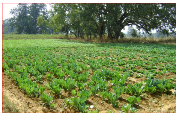
A Demonstration Field at Nimapada Block on Sustainable Agriculture Program organized by the S.P.Foundation during 2013-14.

According to statistics and population data of Odisha, 80% of the people practically living in rural areas depend on agriculture as their principal livelihood. It has been experienced with much tragedy that frequent floods, droughts and other natural disasters responsible for discouraging the farming to accept and consider the agriculture as their livelihood resource. Because, scanty and irregular rain falls destroy the crops prior to reaching in harvesting stage. In this regard, there has been a lot of pathetic and grim affairs experienced by the people. Because, many more farmer's death and suicidal episodes are our past records. The matter was seriously taken up by the founder members of