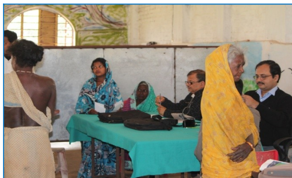
The Health Check Up Camp held at Nimapada Block to provide medical services of the area during 2013-14

The Society found its rich heritage background from a rural landscape and commenced its activities providing need based services particularly for the vulnerable groups which basically cover S.C & S.T, Backward Communities along with other poverty stricken people who have no access to the Health Care facilities as per need of the family . The Organization viewed this subject as primary and essential requirements for such neglected families and decided to provide required services to the deserving masses. Thus, Health Check up Camps were organized in different adopted villages of Nimapada, Gop, Kakatpur, Astranga & Puri Sadar