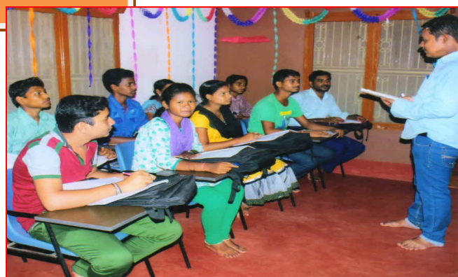
A Computer Training Centre running at Kakatpur Block of Puri District, Odisha

revealed that, a large nos of youth are found un-employed and are in search of job. There is no scope of employments or jobs for such people both at private and Government sectors. Because, after development of so many modern techniques in various fields only skilled and technical personnel's get priority in job and employment sectors. Thus, it was decided by the Society to establish Computer Education Centres at various project fields to accommodate such needy groups of the area. Therefore, the organization opened Computer Training Centres at Block Head Quarters of Nimapada, Gop, Kakatpur, and Astaranga in Puri district for the purpose of, encouraging the un-employed youths of the respective localities. The Priority was given to Schedule Caste, Schedule Tribes and other Socio-economic backward communities. The Professional instructors were engaged to conduct regular education according to prescribed syllabus of the Computer Education. A total of 90 beneficiaries i.e 50 male and 40 female candidates from S.C. & S.T. & backwards Communities were undergone trainings during this year.