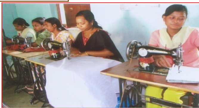
The Trainees are working in a Tailoring, Stitching & Embroidery Centre at Niamapara Block

The Society has been deeply associated with the people of its project area during while going through organizing the people and seeking their involvement and participation in numerous project activities and programs thereof. The poverty stricken Rural people are found with most vulnerable states. The Society S.P.Foundation is committed towards its Constitution and to