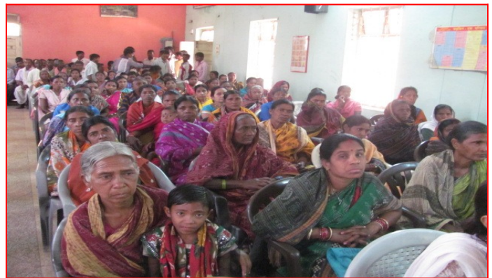
A view of Awareness Campaign on "Swachha Bharat Mission" organized at Gop Block of Puri district during 2013-14

The organization has been working for the Campaign of “ SWACHHA BAHARAT MISSION” being sponsored and encouraged by the Govt. of Odisha. The Campaign was based on Sanitation arrangements and ensuring cleanliness in the villages, cities, Lanes, Govt. institutions, hospitals, including other Public places involving the common people. In this context, the Society has been organizing the people and conducted awareness Campaigns for cleaning of