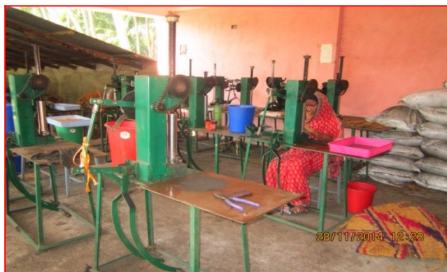
One Training Camp held at Astaranga Block of Puri district & a beneficiary is working .