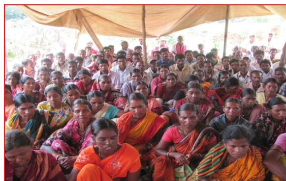
The women of Nimapada Block are in a Self Help Groups meetings during the year 2013-14

Following the Constitution of the Society the founders of the organization are committed to enhance and increasing the traditional life style of Women groups living in abject poverty through their direct involvement in developmental and progressive activities with group spirit. Therefore, it was resolved to organize them in several groups i.e. Self help Groups and impart regular training and orientations towards their capacity development and instill leadership quality. In this regard, the organization formed 350 SHGs Groups in Nimapada, Gop, Kakatpur, Astaranga and Puri Sadar Block of Puri district for promotion and strengthening the women groups about Micro-Credit activities. These Women groups have already involved in thrift and credit business out of their own savings. The NGO has also been providing regular aid services to